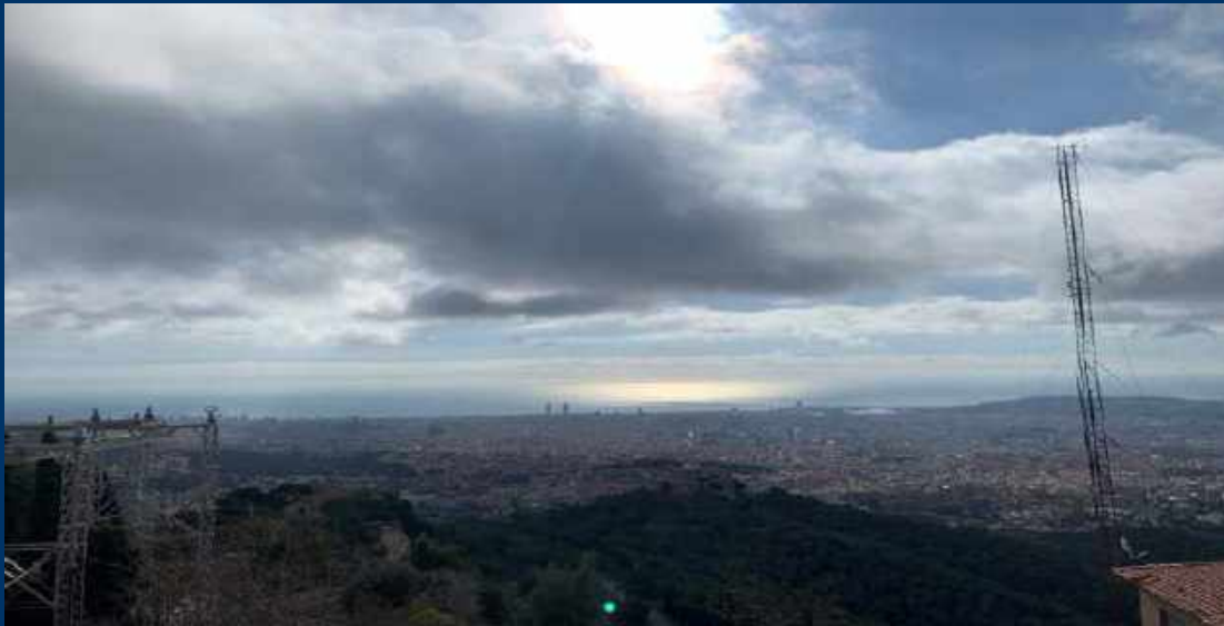
Tibidabo and Montjuic

Barcelona is surrounded by hills, so walking around this city offers Unforgettable views.